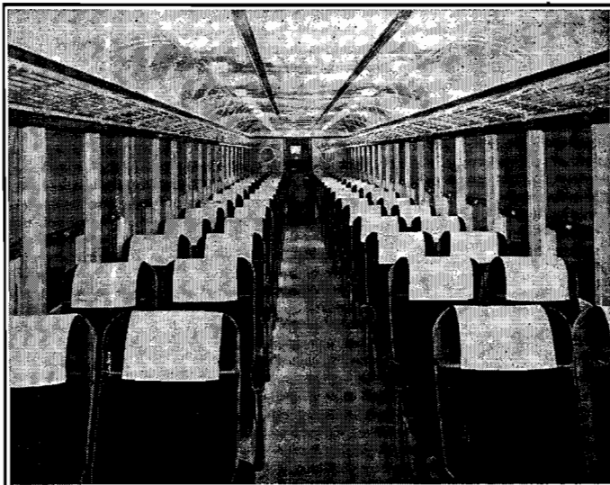
MODERN AIR-CONDITIONED COACHES