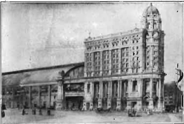
WABASH STATION, PITTSBURGH, PA.

FOR DETAILED INFORMATION CON- SULT WABASH SYSTEM AGENTS.