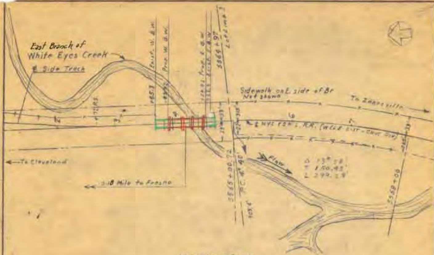
LOCATION PLAN Scale: 1"=100'